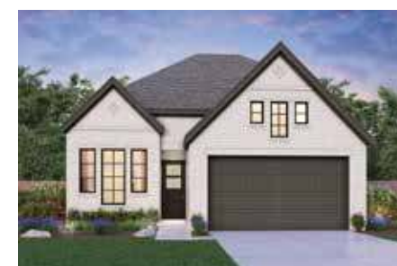
Hamilton Thomas Homes