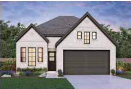
Hamilton Thomas Homes